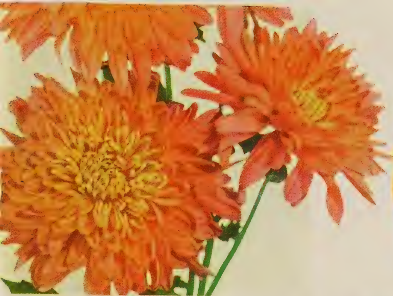
OLIVE LONGLAND. 50c each; 3 for $1.25